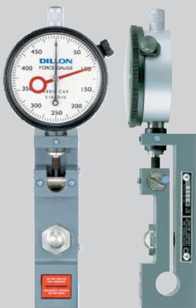
Low Profile Gauge